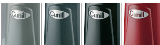
GREY DARK GREY BLACK PURPLE